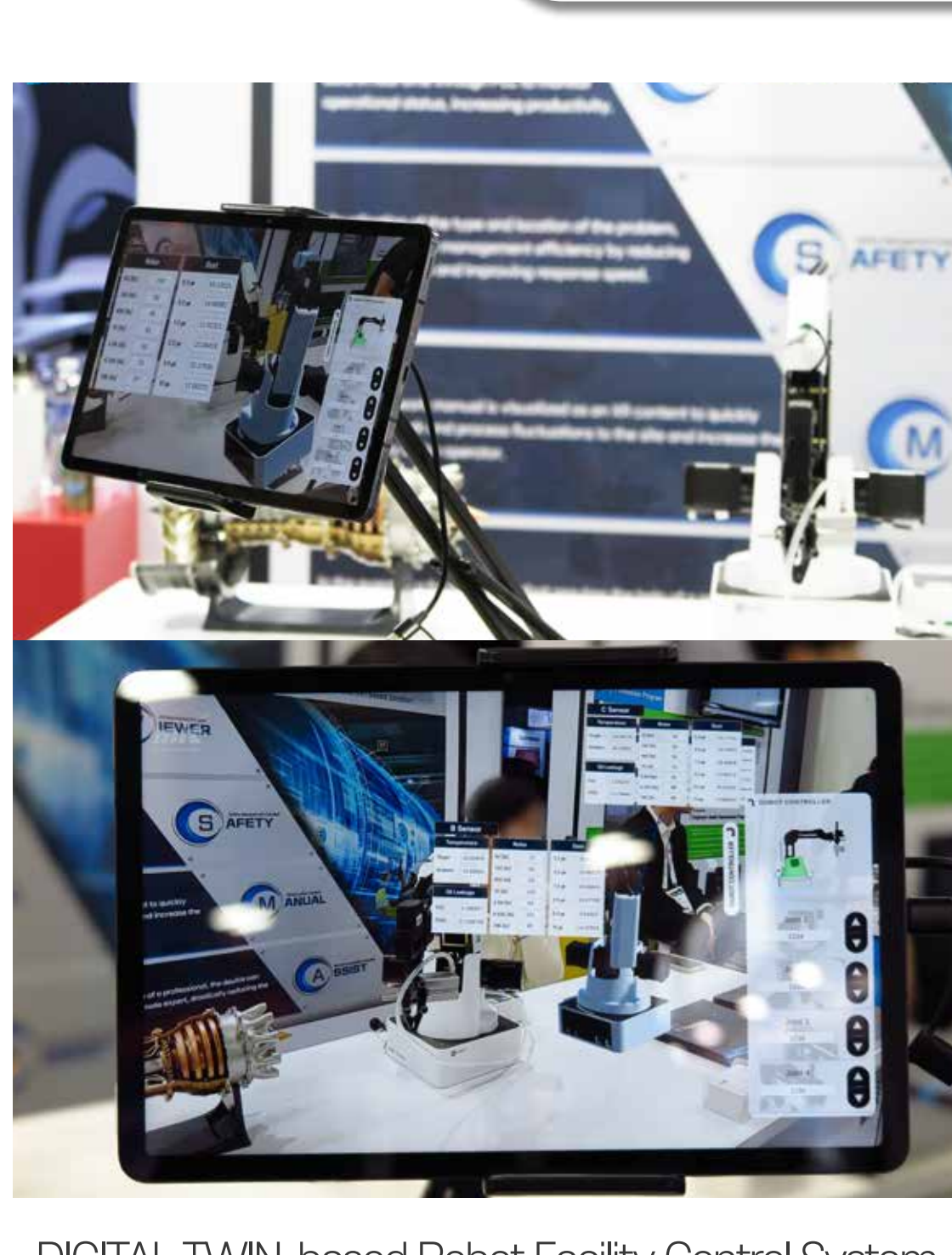
DIGITAL TWIN-based Robot Facility Control System