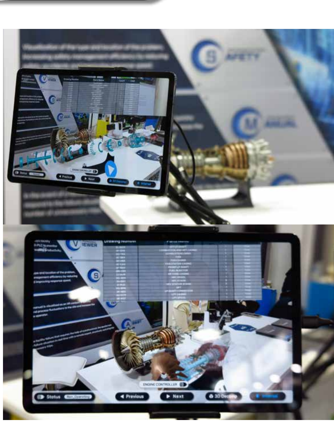
XR-based CAD Quality Inspection System